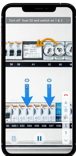
Figure 2: TeamViewer Pilot support requesters see annotations and visual guides placed on their screen by the remote expert supporter, clarifying every step.

Guide users to perform common tasks they will have to perform routinely instead of doing the tasks for them.