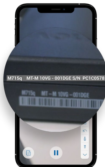
Figure 3: Using object character recognition (OCR), TeamViewer Pilot converts a serial number into searchable text.