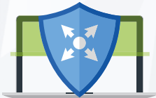
Malwarebytes Endpoint Protection